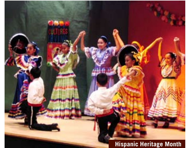
Hispanic Heritage Month

The Central Library, 801 W. Irving Blvd., will host a celebration of Asian culture from noon to 5 p.m. Sept. 10. Taiwanese, Chinese, Vietnamese, Filipino, Cambodian and Japanese culture will be showcased through native and folk dance demonstrations. Included are a fully costumed lion dance, live traditional music and Taiko drumming, calligraphy demonstrations, Chinese acrobatic performances, crafts and games. The festival will end with