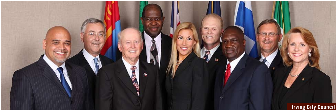
Irving City Council