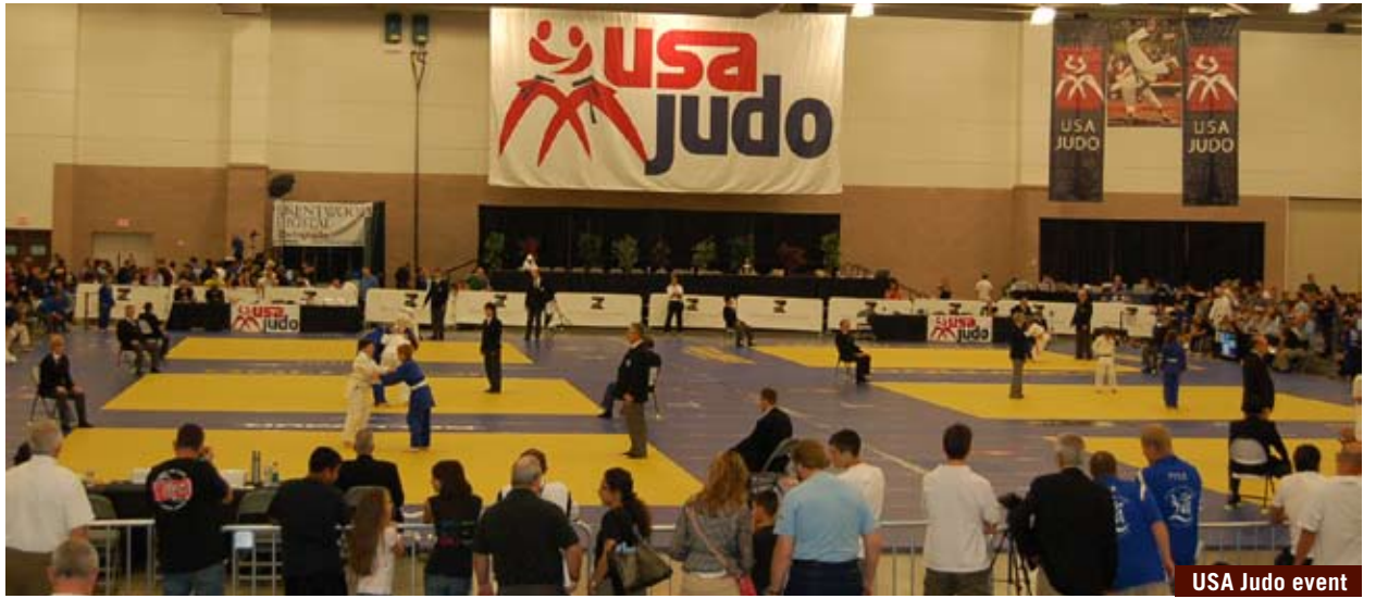
USA Judo event