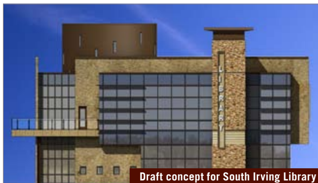
Draft concept for South Irving Library