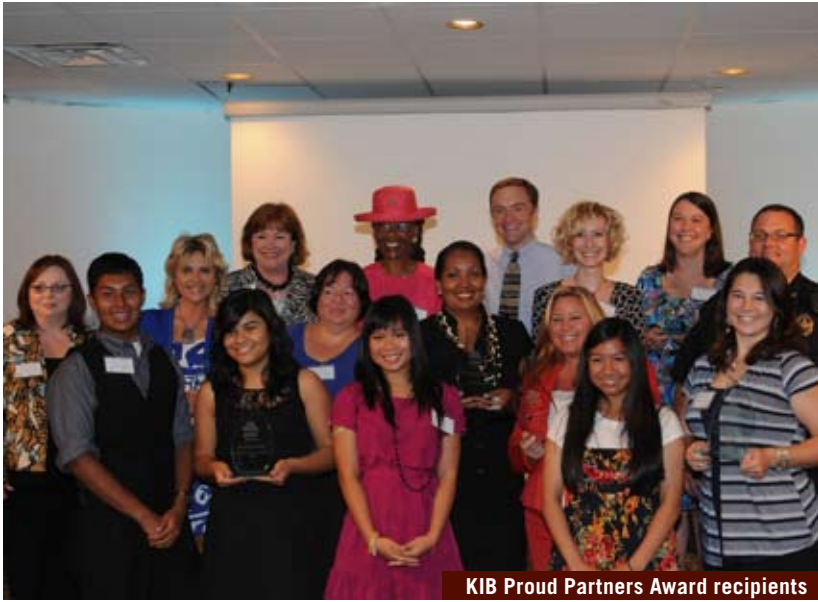
KIB Proud Partners Award recipients