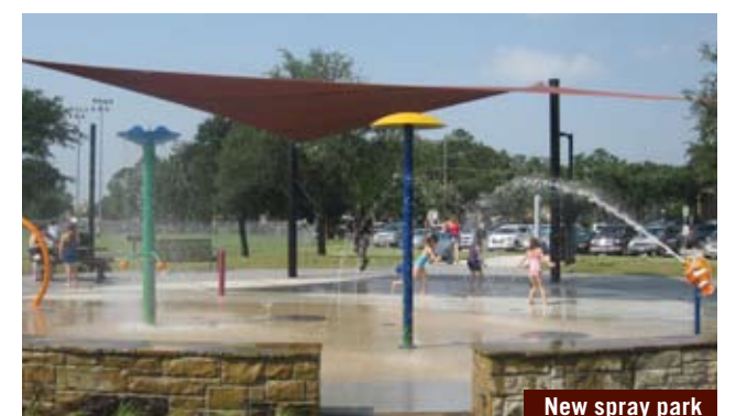
New spray park

City departments report cost savings and efficiencies on a quarterly basis. All city employees are encouraged to implement efficiencies that will reduce costs while maintaining or improving services. ■