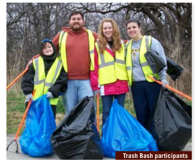
Trash Bash participants

KIB will supply litter pickers, vests, gloves and trash bags. Register at www.rockthegreen.org . Send an email to info@rockthegreen.org or call (972) 721-2175 for more information. ■