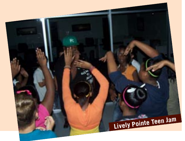
Lively Pointe Teen Jam