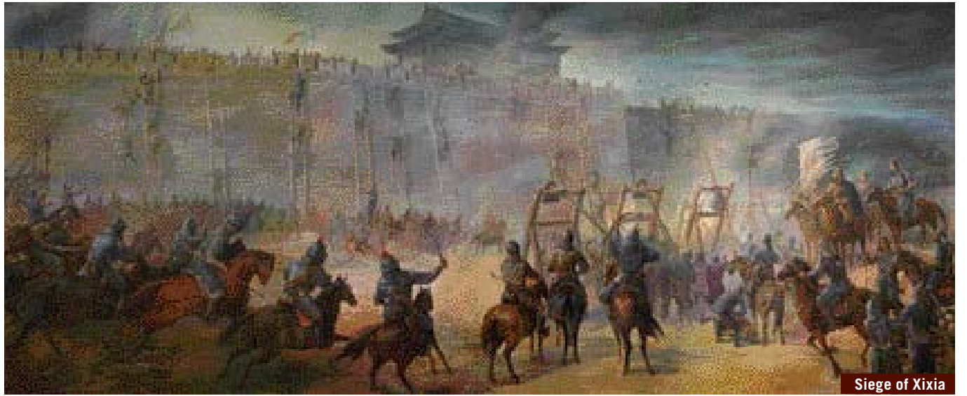
Siege of Xixia