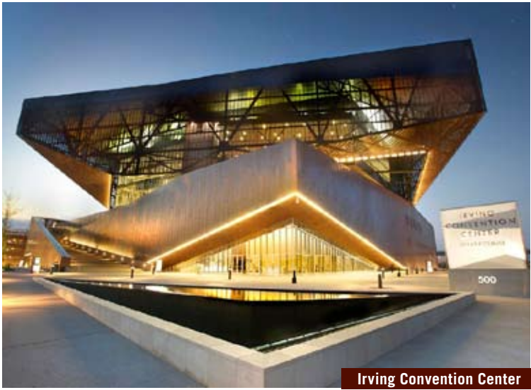
Irving Convention Center