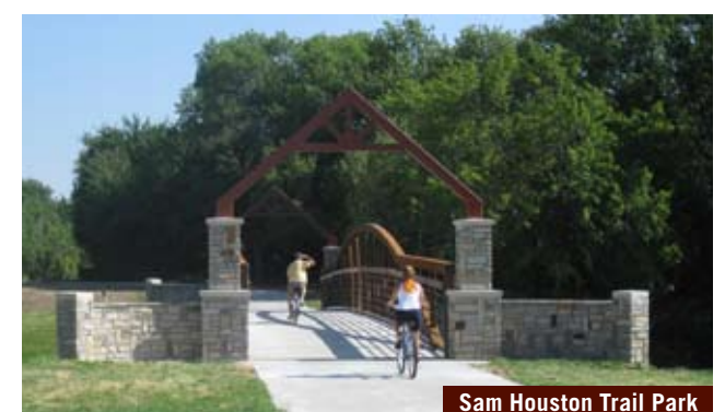
Sam Houston Trail Park

When the master plan is completed, it will cover a total of 22 miles. Access to Campión Trails is available from sunrise to sunset daily. Visit www.cityofirving.org for more information on Irving's parks and trails system. ■