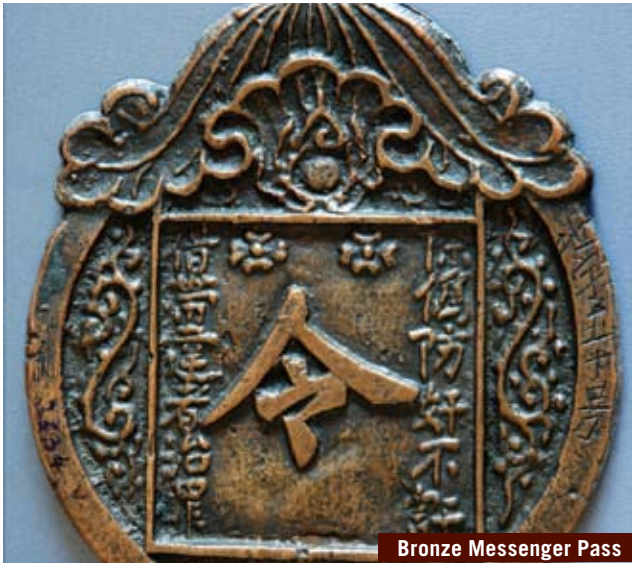
Bronze Messenger Pass