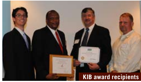
KIB award recipients